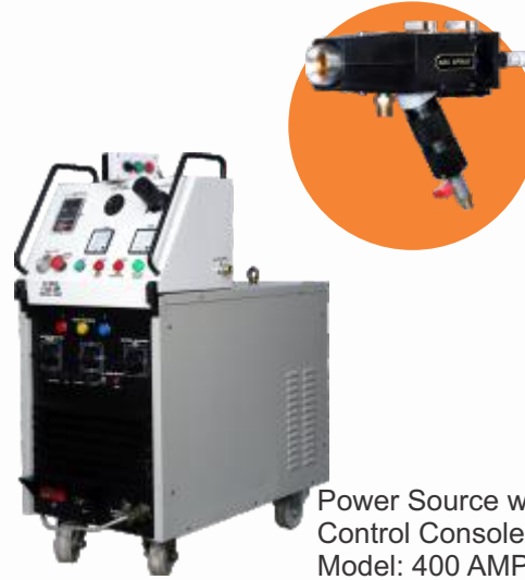
Power Source with Control Console Model: 400 AMP