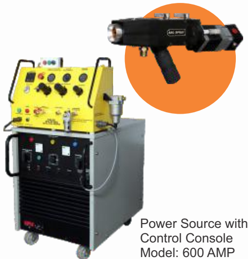
Power Source with Control Console Model: 600 AMP